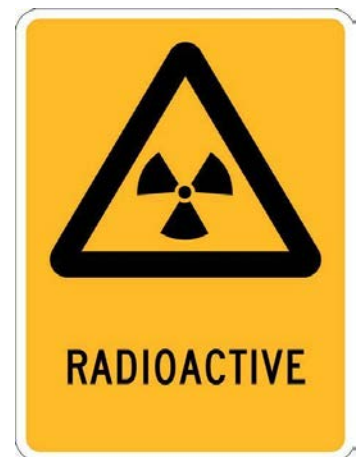
Fig 4 Storage cabinet