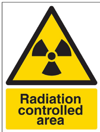
Fig 3 Entry of controlled area